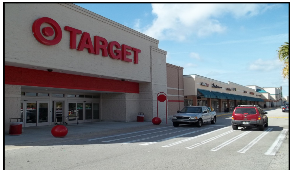
490 Marsh Landing Parkway, Jacksonville Beach, FL 32250